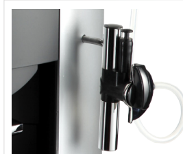
Replaceable 2-stage frothing jet Replaceable hot water nozzle