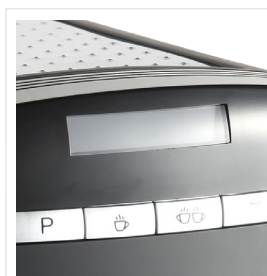
Display Dialog System