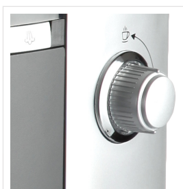
Steam/hot water draw off valve